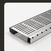
120SCSPSiMTL Punched Slot