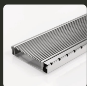
120SCSARiMTL Architectural Grate

Available in Stormtech's exclusive range of designer grates and tile inserts with natural stainless steel finish, or a luxurious electroplate or powder coat.