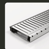
120SCSPPSiMTL Punched Perpendicular