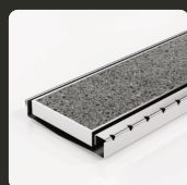
120SCSTiMTL Tile Insert