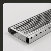
120SCSMNDiMTL Marc Newson Design