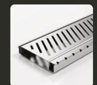
120SCSPASiMTL Punched Angle

Telephone 1300 653 403 | Web stormtech.com.au