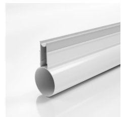
SD90 | SD90H 90mm Drainpipe Beige uPVC Channel

Visit stormtech.com.au for detailed assembly and installation information.